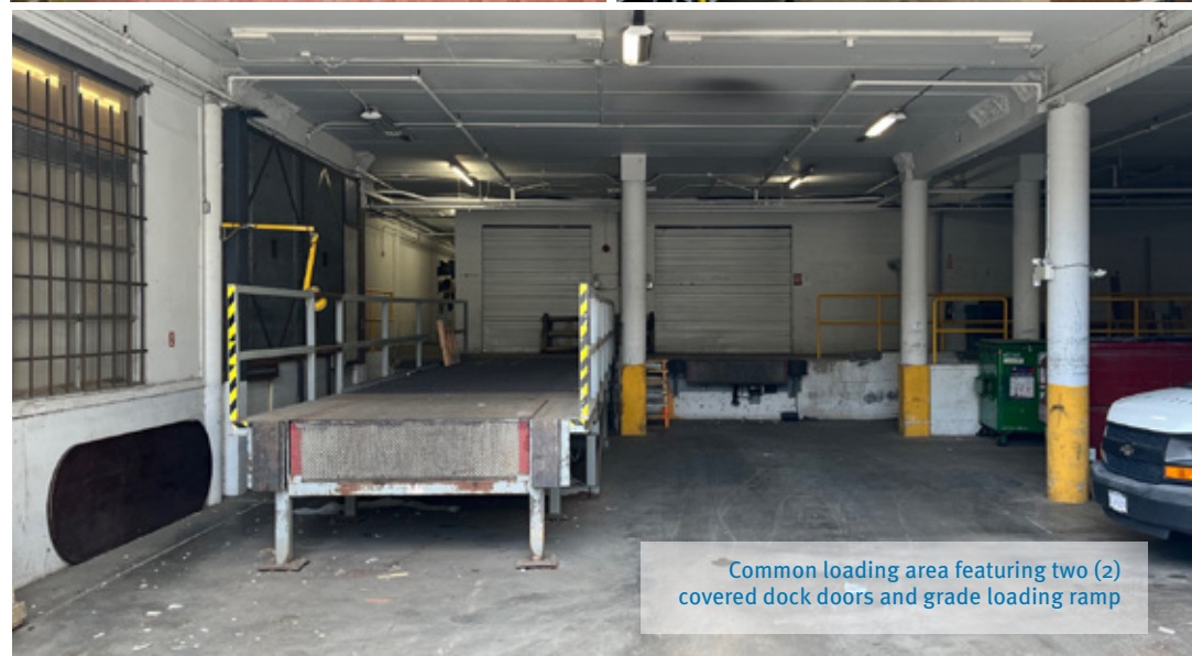
Common loading area featuring two (2) covered dock doors and grade loading ramp