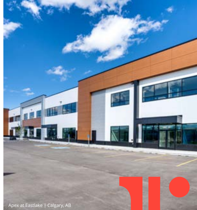
Apex at Eastlake | Calgary, AB