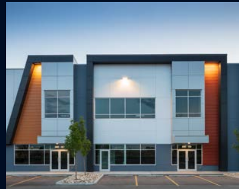
Evolve at District | Calgary, AB